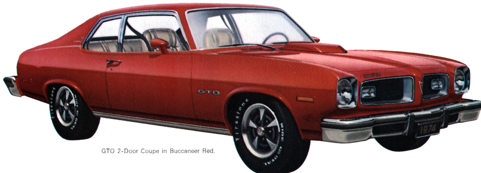
GTO 2-Door Coupe in Buccaneer Red.

After all, the Wide-Track people have a way with cars.