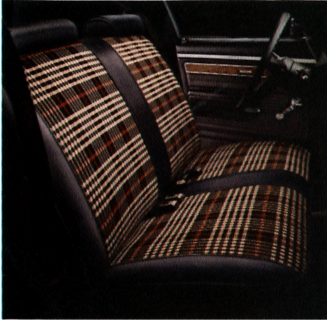
Standard bench seat upholstered in cloth and Morrokide. Shown in black/white/red plaid—also available in black/white/green plaid.