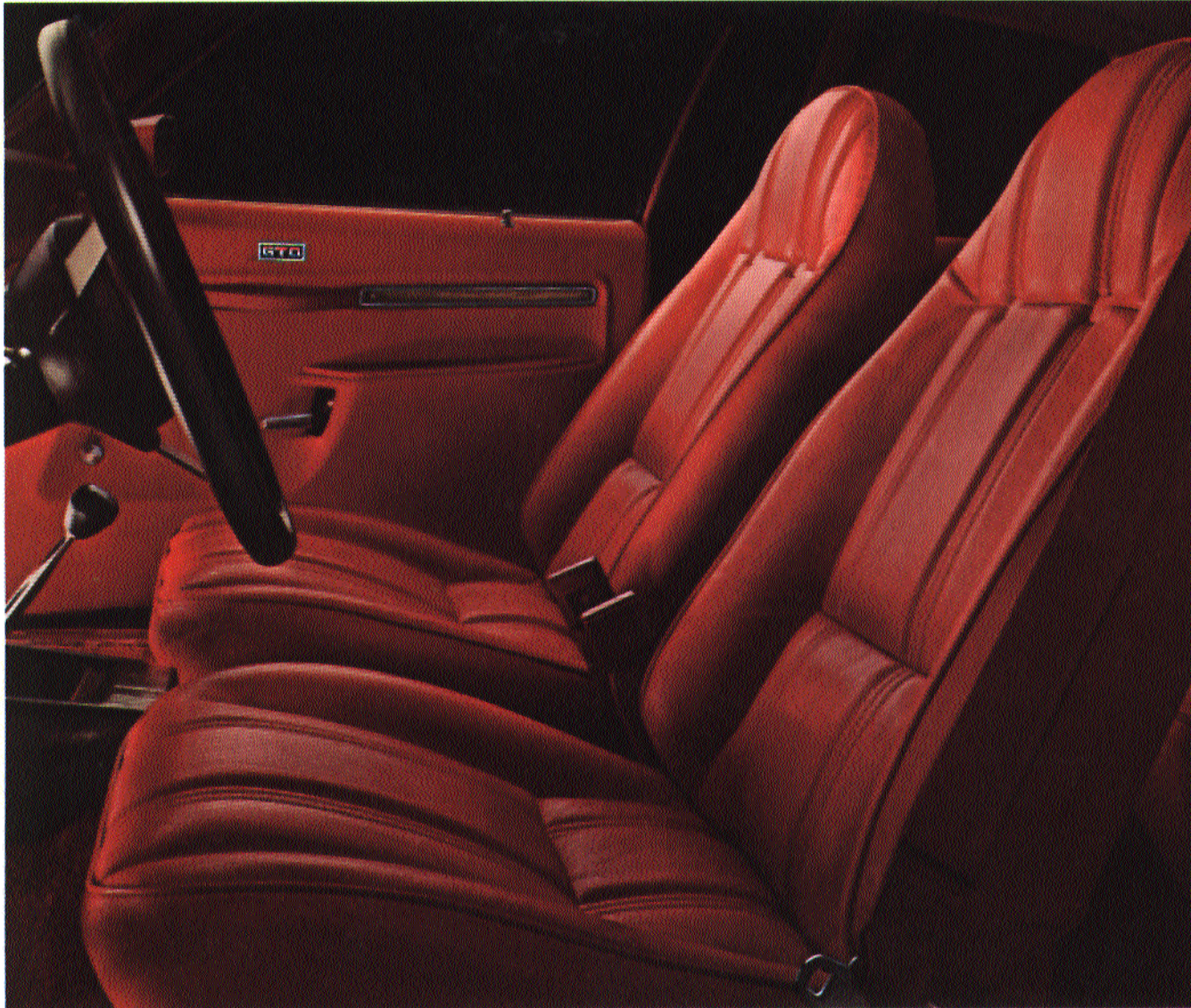
Available all-Morrokide bucket seats. Shown in red—also available in white, saddle and green.