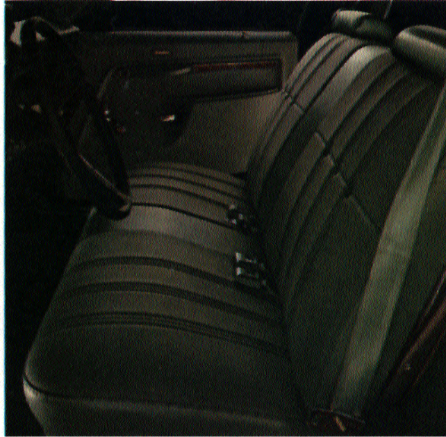
Custom bench seat upholstered in cloth and Morrokide. Shown in green—also available in black.