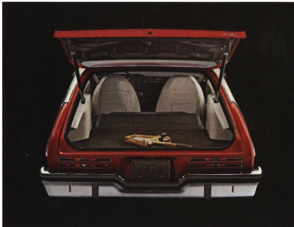
The GTO Hatchback hatch.